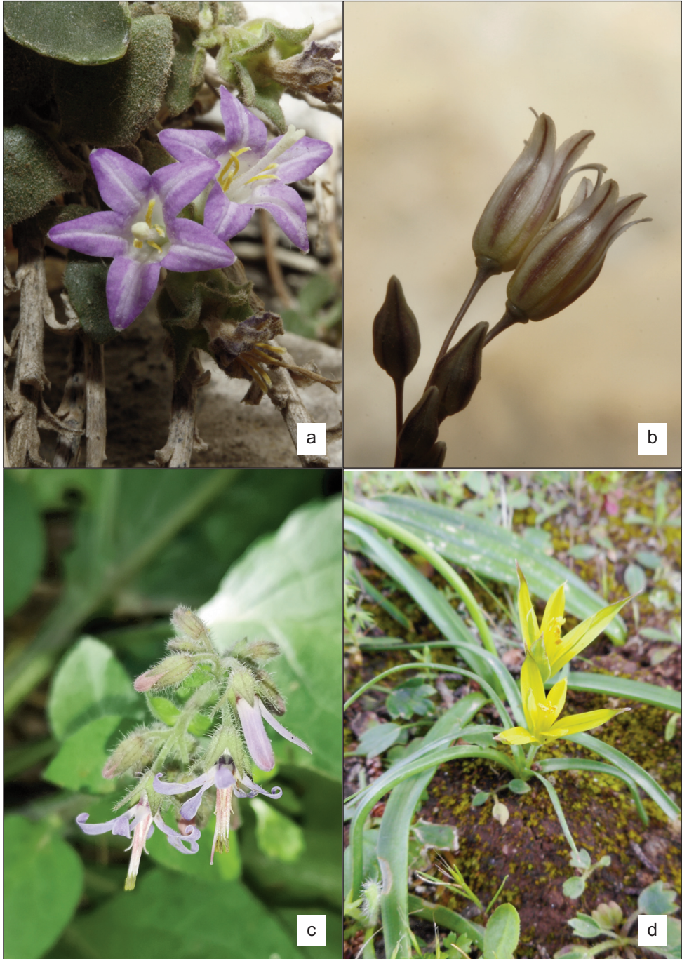
Fig. 3. a) Campanula heterophylla , Xsero Ksylo (Sifnos); b) Allium tzanoudakisianum , Kapsalos (Sifnos); c) Symphytum creticum , Profitis Ilias Mt. (Sifnos); d) Gagea rigida , Kapsalos (Sifnos).