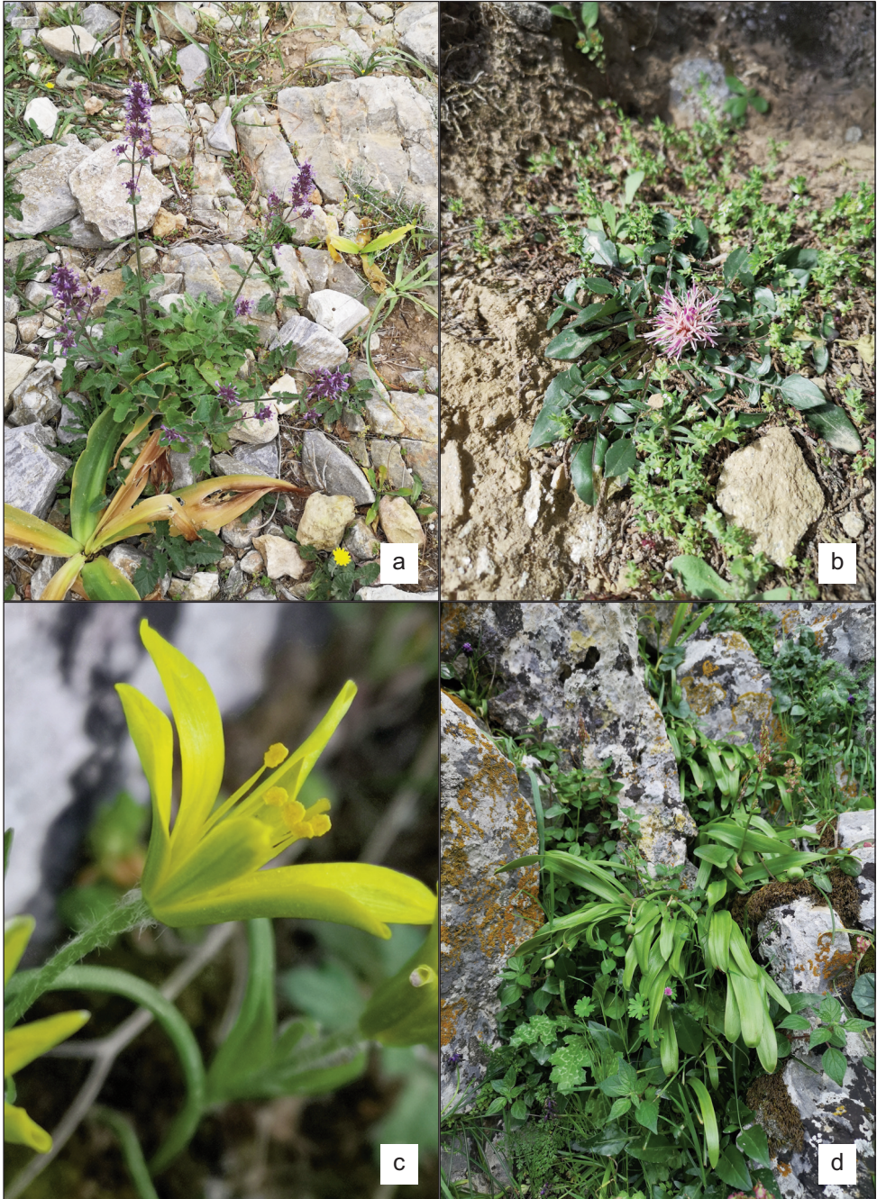
Fig. 2. a) Nepeta melissifolia , Herronisos (Sifnos); b) Centaurea raphanina subsp. mixta , Ilias Mt. (Sifnos); c) Gagea pseudopeduncularis , Xsero Ksylo (Sifnos); d) Galanthus ikariae , Xsero Ksylo (Sifnos).